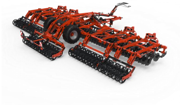
Image: KUHN Optimer 12500 L

Caption: The widest Optimer 12500 L features Steady Control to guarantee even working depth across the width